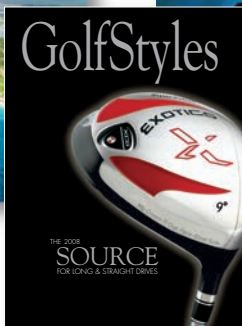
EXAMPLES OF COVER PRODUCT DISPLAY